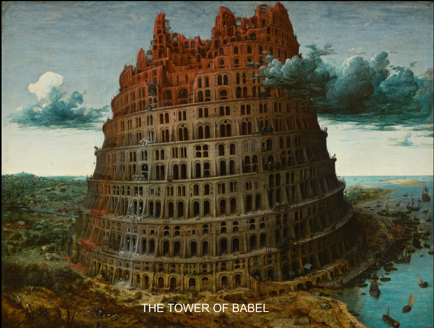
THE TOWER OF BABEL